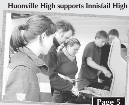
Huonville High supports Innisfail High