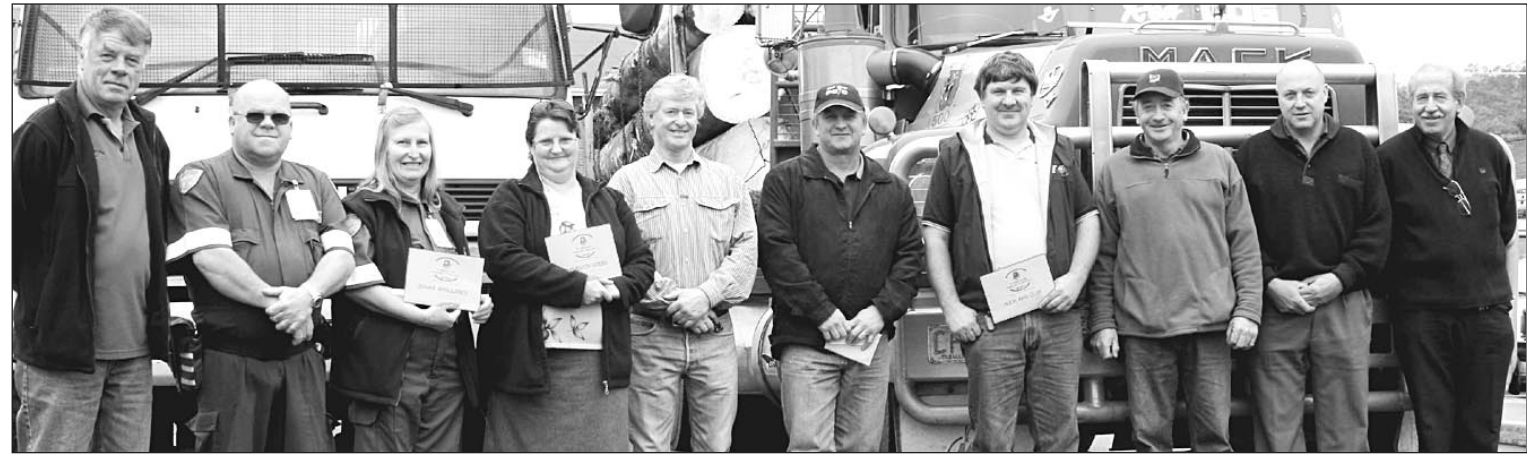
Some of the community groups who received funding — committee representatives and community leaders (including the Mayor and Deputy Mayor). (P.S.)