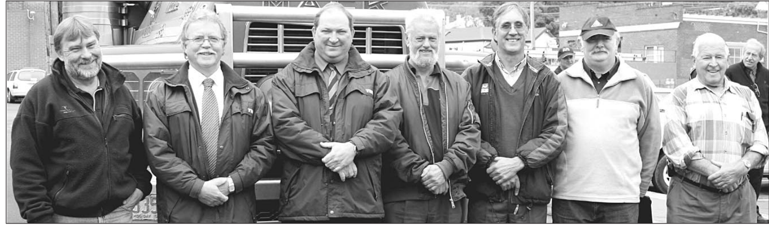
Some of the Forest Festival sponsors who attended the presentation ceremony. (P.S.)